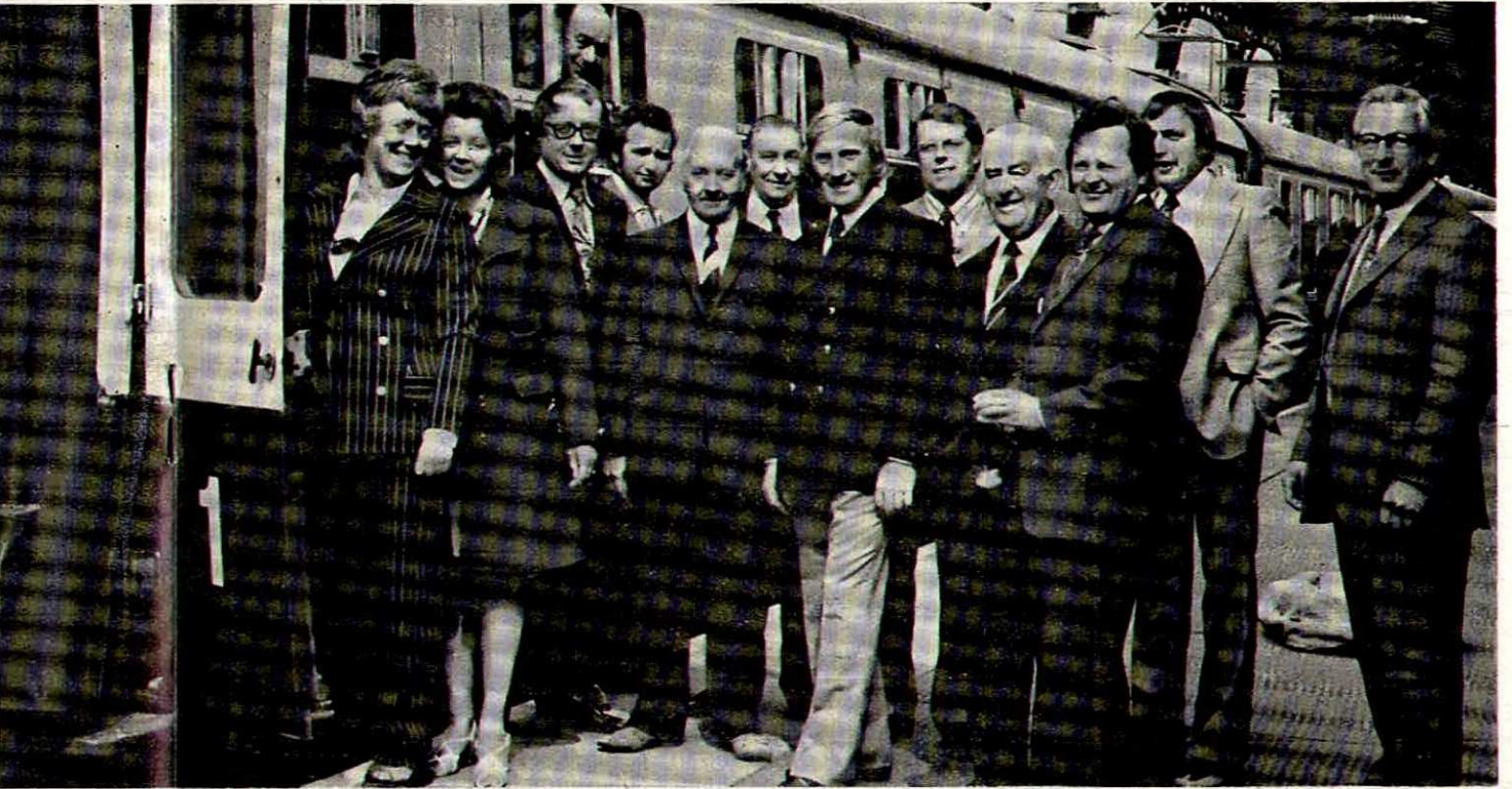
North End supporters leave for Villa on the League Liner